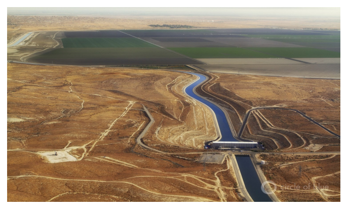
Water infrastructure in the United States is not designed for future climate changes, say authors of a U.S. government climate report.

Water infrastructure was not designed for past climate extremes, let alone future changes, report authors say.