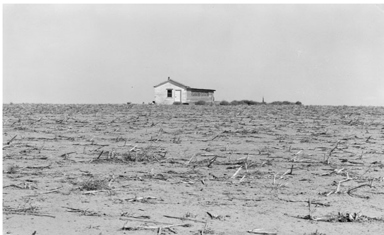
"Abandoned house, Haskell County, Kansas"

The economic and social problems that came to the fore as the Dust Bowl in the 1930s actually began in the '20s, triggered in part by poor land-management practices. The area, home to millions of American farm families, already faced difficult conditions in the wake of the Great Depression.