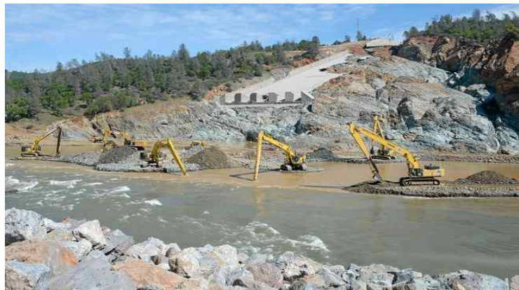
Excavators remove debris from the Diversion Pool below the main Oroville Dam spillway in this photo from March 29.

That spillway must be repaired and repaired fast. And so the announcement, bidding and awarding of contracts process, which normally takes years, has been done in less than two weeks. The actual construction work to repair the spillway began in early May, after more than two million tons of rock and dirt washed into the Feather River had been removed. That job was done on a 24 hours per-day, seven days a week schedule.