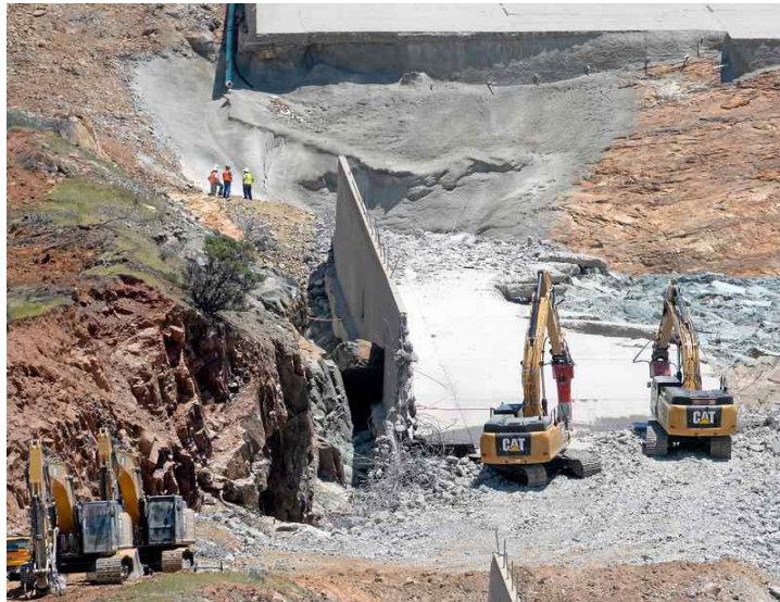
Heavy equipment works Wednesday to break up remaining concrete on the lower part of the damaged main Oroville Dam spillway so a replacement can be constructed.

From where would that money come? Virtually out of thin air. It certainly had not been budgeted. The Governor, Jerry Brown, requested from FEMA emergency funds for repairing the spillway and other infrastructure damaged by the winter storms. On April 2, the Trump administration announced that the President had approved federal aid to California of $274 million for Oroville Dam repair and other needs.