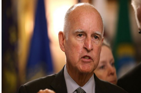
"Ready to fight Gerry"

http://thehill.com/blogs/blog-briefing-room/news/310512-california-gov-were-ready-to-fight-trump-onclimate-change